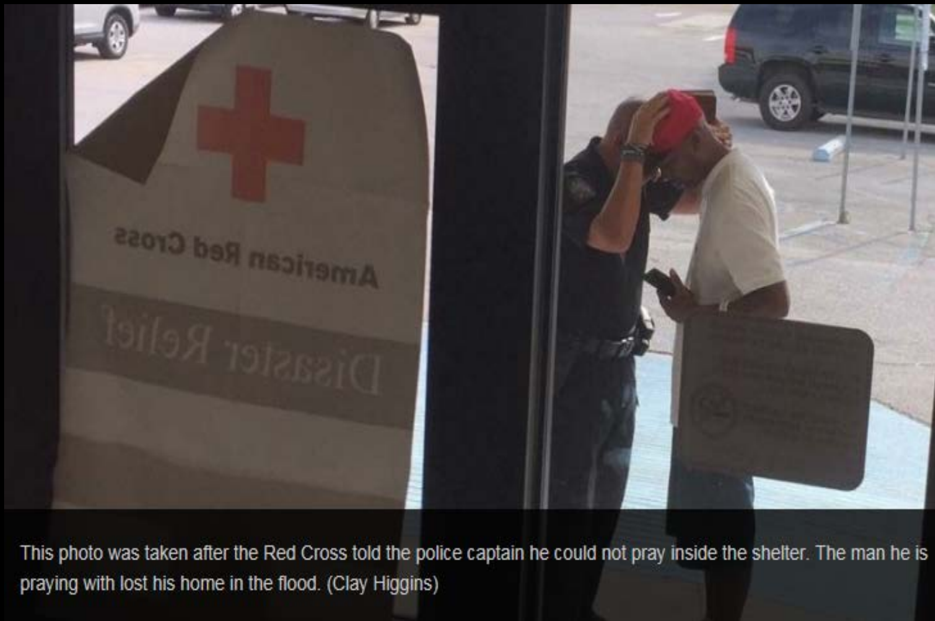
This photo was taken after the Red Cross told the police captain he could not pray inside the shelter. The man he is praying with lost his home in the flood.